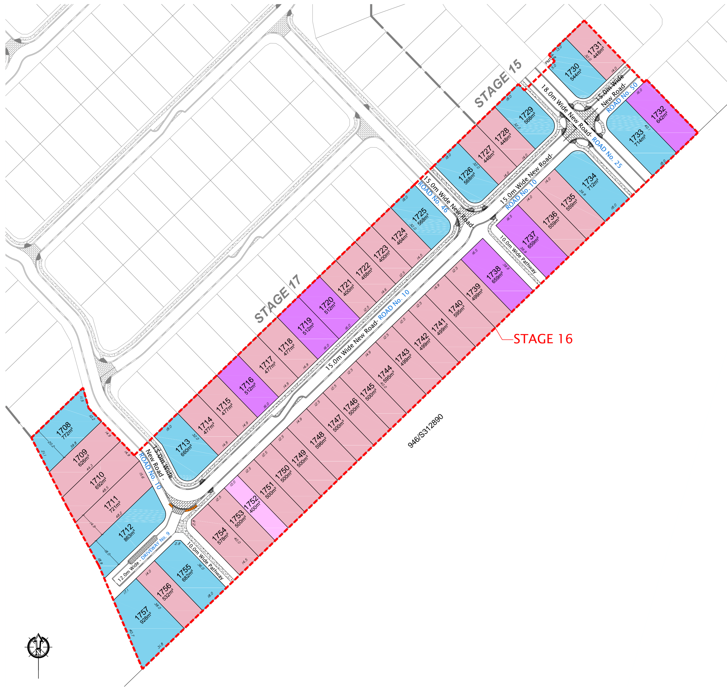
Context Plan (nts)